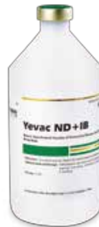
Yevac ND+IB Binary Inactivated Vaccine of Newcastle Disease and Infectious Bronchitis