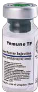
Yemune TF Transfer Factor Injection