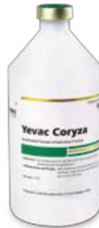
Yevac Coryza Inactivated Vaccine of Infectious Coryza