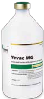
Yevac MG Inactivated Vaccine of Mycoplasma Gallisepticum