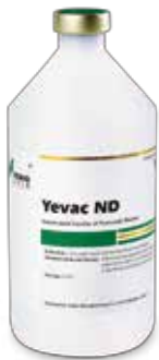
Yevac ND Inactivated Vaccine of Newcastle Disease