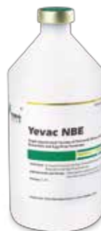
Yevac NBE Triple Inactivated Vaccine of Newcastle Disease, Infectious Bronchitis and Egg Drop Syndrome