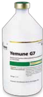
Yemune G7 Inactivated Vaccine of Recombinant Newcastle Disease Virus (A-VII strain)